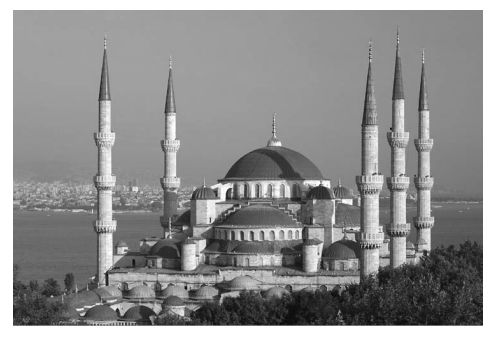
Figure 3. Sultan Ahmet Mosque in Istanbul, influenced by the Byzantine architecture

Damascus, presents an illustrative example of such a process. Its urban fabric dominated by the Hellenistic-Roman architecture had deeply influenced the Umayyad architecture. The Great Mosque of Damascus for instance witnessed a re-use of the building materials, the adoption of the axial organization as well as the ornaments that were found onsite<sup>19</sup> (Figure 3). According to historians, Christian masons and craftsmen took part in the edification process of this mosque that became a reference model for a generation of mosques to come, such as Al-Qairaouan and Cordoba.