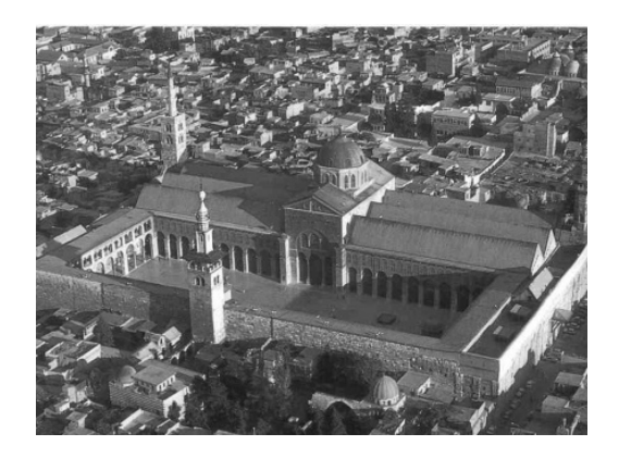
Figure 1. Great Mosque in Damaskus, influenced by the Roman architecture

Islamization of knowledge is a recent term that was developed by contemporary Muslim scholars in order to bridge the gap between Islam and the various fields of modern thought (Figure 1)<sup>1</sup>. Modern disciplines must be critically examined and their philosophical foundations be recast into the Islamic vision, while the Islamic thought should benefit from the recent progress in methodologies, approaches, instrumentations, and progress in new sciences<sup>2</sup>.