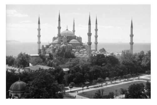
Figure 4. The public building Aghia-Sofia as well as private house that were integrally inherited by Muslims

Constantinople, the capital of Byzantine empire, is another example of such a process. Baths, aqueducts, and public buildings such as Aghia-Sofia, as well as private houses that were integrally inherited by Muslims, had deep impact on the development of the Ottoman architecture during the three centuries of the empire. The huge central dome standing on the large span columns presented an ideal concept that liberates the prayer room and thus turned into a historical prototype that spread all over the Ottoman territory (Figure 4).