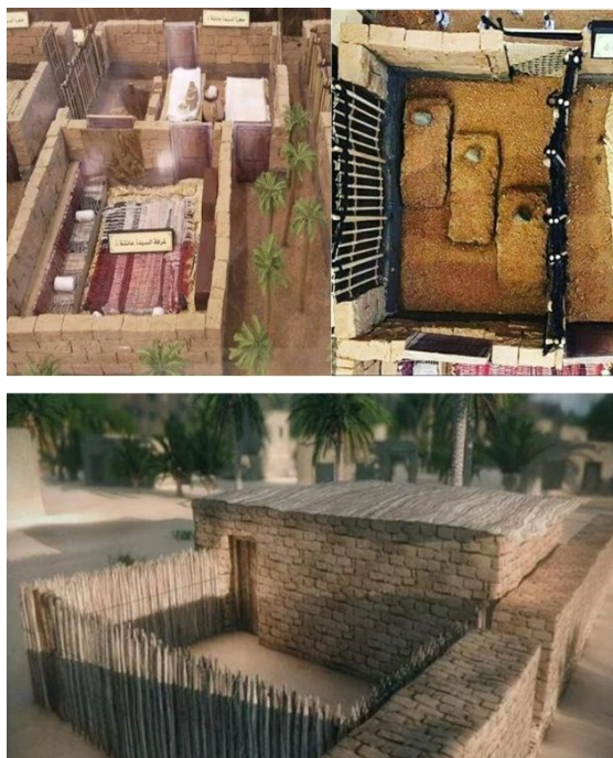
Figure 2. Illustration of the house of the prophet Muhammad (Youtube: Muslim Central: Replica of The Prophet's ﷺ House | Inside The House of Aishah (ra) - Shaykha Fatima Barkatulla)

Islamic principles that are very compatible with the concept of building a house are Habluminallah , Habluminannas and Habluminal'alam . The application of Islamic principles in the design of residential homes, among others, is the application of the Value of Habluminallah . A comfortable dwelling is a house that can provide peace and security for its inhabitants or a house that meets the criteria of an Islamic house. The following is an illustration of the Prophet Muhammad SAW's house design which can be used as a reference for ideas for building a house. This illustration can be seen in Figure 2.