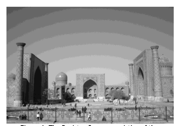
Figure 6. The Registan Square consisting of three Madrasahs (Schools) in Samarkand, Uzbekistan