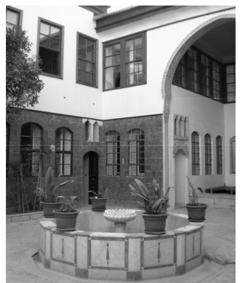
Figure 5. A courtyard house in Damascus, Syria