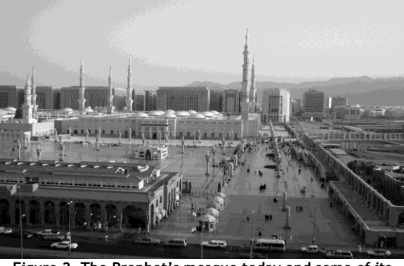
Figure 2. The Prophet's mosque today and some of its surrounding areas, seen from a nearby building. The size of today's Prophet's mosque, with all of its adjoining facilities and infrastructure, is approximately the size of what the core of the city of Madinah during the Prophet's time was.