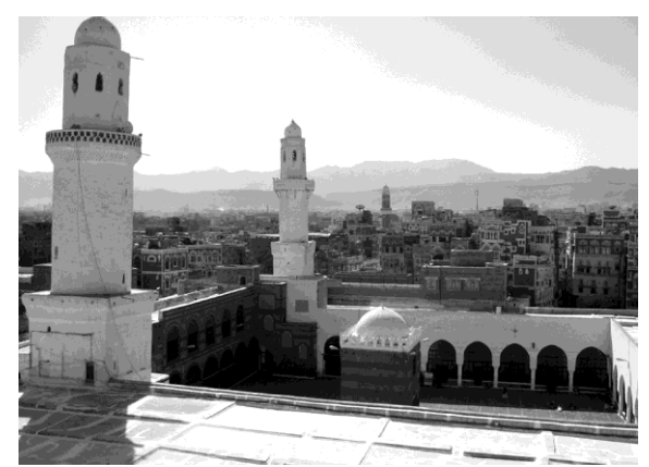
Figure 4. The Great Mosque in San'a, Yemen