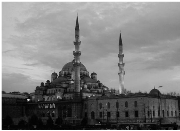
Figure 3. The Eminonu Yeni Mosque in Istanbul, Turkey

Islam teaches, furthermore, that nature's resources and forces are gifts granted by God to man. "The gift, however, is not transfer of title. Man is permitted to use the gift for the given purpose, but the owner is and always remains Almighty God" 21