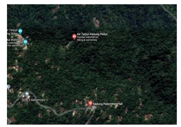
Figure 2. Sampling location at Kedung Pedut Waterfall