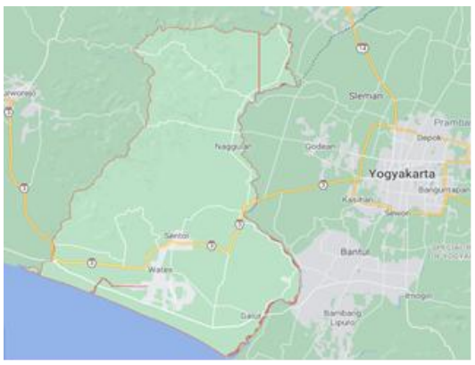
Figure 1. Maps of Kulon Progo Regency

This research was conducted in area of Kedung Pedut waterfall, Jatimulyo Village, Kulon Progo Regency, Special Region of Yogyakarta on 14 - 15 April 2018 (Figure 1). This location is famous for ecotourism waterfall which has beautiful water color and preserved vegetation in the surrounding area (Figure 2).