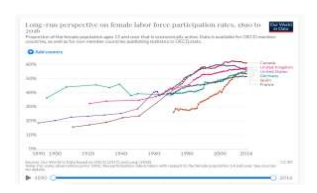
Figure 1. Long-Term Perspective of Female Labor Force Participation Rate from 1890 to 2016. (https://ourworldindata.org/female-labor-supply)

The increase in the number of female workers is one of the important markers of economic growth. Note that a sharp increase in the number of female workers occurred in the 20th century, where the number of women participating in the labor market in early industrialized countries is shown in graph 1.0. This graph illustrates the level of participation of economically active women by combining data from OECD (Organization for Economic Cooperation and Development) members. The graph shows a positive trend in all countries, although starting at different points in time and continuing at different levels; yet the substantial and sustained increase in female labor force participation in rich countries remains a striking feature of economic and social change in the twentieth century.