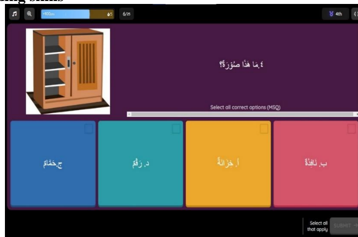
Figure 3. Creating Questions on the Quizizz Platform