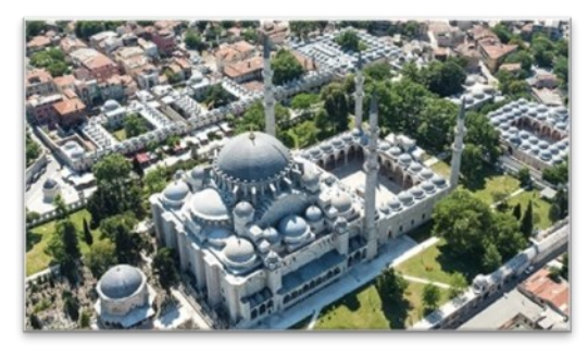
Figure 3. Süleymaniye Mosque [23]

The Süleymaniye Mosque dates back to the 16th century during the reign of Sultan Suleiman. It was built within a vast complex that includes educational, health, and caravanserai buildings. This mosque was built with a plan similar to the Hagia Sophia Church, shown in Figure 3. However, the designer optimized its function as a mosque through the attempt to build the possible largest space for prayer without separating the rows of worshipers; the area of the dome was enlarged, and the building was lit through several windows on both sides of the mosque [8].