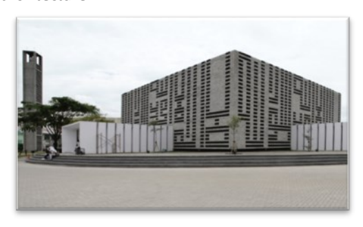
Figure 7. Al-Irsyad Mosque [28]

The construction of the mosque took approximately a year. The mosque's building area is 1,100 m2 and has a capacity of 1,500 worshipers. The mosque has a cubic shape inspired by the shape of the Kaaba, as shown in Figure 7. Its surrounding landscape formed circular lines inspired by the Tawaf concept (pilgrims' journey around the Kaaba). The building walls were carved with 3D inscriptions, and these decorations formed the building openings playing an essential role in introducing lighting and natural ventilation into the mosque [27]. In addition, the mosque was designed based on sustainability trends in architecture.