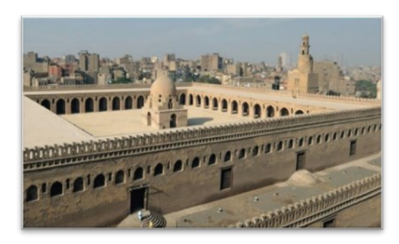
Figure 1. The Lost City of Ibn Tulun [20]

The mosque dates back to the ninth century. The most important characteristic of the mosque architecture is its arcades and corridors, creating a buffer area to reduce noise from the surroundings, as shown in Figure 1. Large pillars, each of which consists of four columns, support the arcades. The mosque has many entrances on its three sides, and many arched openings are used for lighting and structural purposes. In the middle of the courtyard, a dome is structured on pillars, and underneath it provides a fountain for Wudu. The prayer hall is distinguished by the existence of six mihrabs built during different periods. Five of them are flat, and the main mihrab is concave. The mosque is known for its stone minaret and is surrounded by an external staircase located near the mihrab main axis [19].