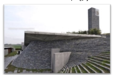
Figure 9. Sancaklar Mosque [32]

Furthermore, natural stone is used as building materials creating additional harmony with the location. The minaret has great importance in distinguishing the mosque because it is located lower than the street. Therefore, the minaret becomes the point of attraction of the mosque [31].