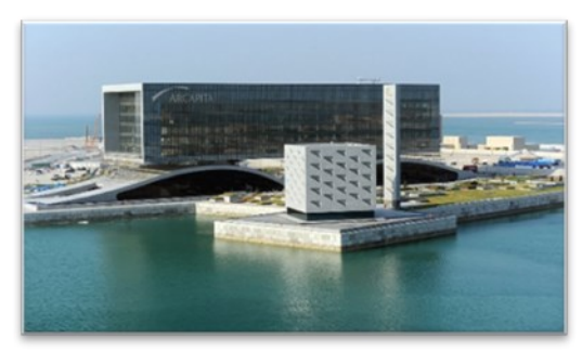
Figure 8. Arcapita Mosque [29]

Arcapita Mosque was constructed on the same site as the Arcapita Bank building and had a capacity of 130 worshipers [29]. It consists of a cubic block of two floors, and the upper floor is for women, as shown in Figure 8. The facades consist of triangular units and have openings to let natural light in [30].