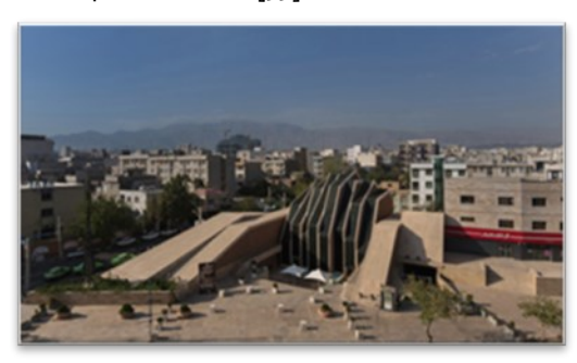
Figure 10. Imam Reza Complex Mosque [33]

The basic idea of the mosque design is to encourage union and connection between different groups in society. Therefore, the designer expresses the idea of interlocking hands as evidence of unity and cohesion. The concept of interlocking hands forms the main space in the mosque, and the prayer hall is built underneath. Such main space design represents a symbolic dome shape, thus evokes the feeling of being close to God, as shown in Figure 10. Additionally, lower blocks on the sides of the building served the rest of the mosque's functions [33].