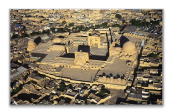
Figure 2. Isfahan Mosque [22]