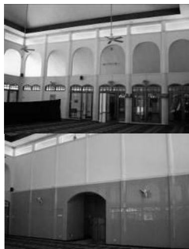
Figure 1. Masjid Al-Maghfirah's Interior

To increase the acoustic quality of a mosque in the tropical area, the field mesurement should be done first to recognize the real value. The measurement has been done in Masjid Al-Maghfirah, Masjid Nurul Iman, and Masjid Baitussalam as samples for this research. The mosques are all in the housing areas with the same level of noise.