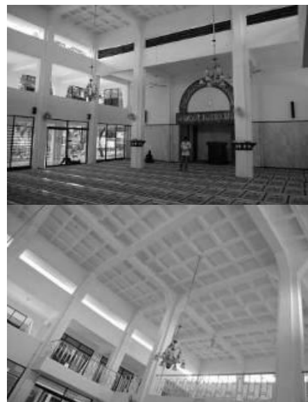
Figure 5. Interior of Masjid Baitussalam