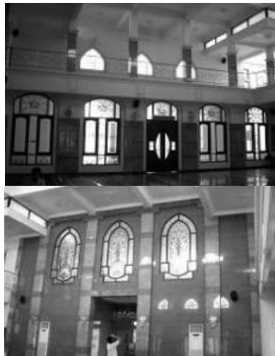
Figure 3. Interior of Masjid Nurul Iman

Meanwhile, Masjid Nurul Iman (Figure 3 - 4) is located at Margorejo Indah Estate, Surabaya. The south and the north side of this mosque is the highest source of noise, while the west side bounds with the residential buildings and the east side is