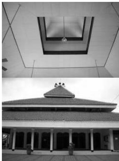
Figure 2. The ceiling (above) and exterior (below) of Masjid Al-Maghfirah

Masjid Al-Maghfirah is located at Rungkut Asri Estate Surabaya. This building is surrounded by residential buildings, except the south side that is exactly next to the road. This side is the highest noise source for the building. The plan shape is square (Figure 1 - 2), while the ceiling shape is crown. The mosque's dimension is 14,5 x 14,5 x 8 m 3 . The composition of materials in this mosque are some reflection materials, which are glass window, glass door, brick plester wall, and ceramic tile on wall. All area of the floor is covered by carpet. The area of opening is 23% of wall area, which could decrease the reflecting area.