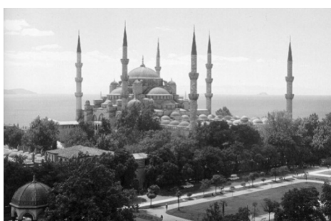
Figure 4. The public building Aghia-Sofia as well as private house that were integrally inherited by Muslims

Constantinople, the capital of Byzantine empire, is another example of such a process. Baths, aqueducts, and public buildings such as Aghia-Sofia, as well as private houses that were integrally inherited by Muslims, had deep impact on the development of the Ottoman architecture during the three centuries of the empire. The huge central dome standing on the large span columns presented an ideal concept that liberates the prayer room and thus turned into a historical prototype that spread all over the Ottoman territory (Figure 4).