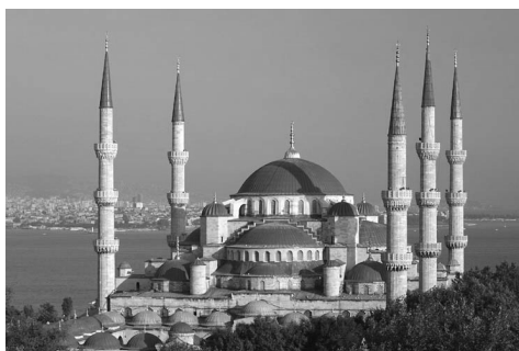
Figure 3. Sultan Ahmet Mosque in Istanbul, influenced by the Byzantine architecture

Damascus, presents an illustrative example of such a process. Its urban fabric dominated by the Hellenistic-Roman architecture had deeply influenced the Umayyad architecture. The Great Mosque of Damascus for instance witnessed a re-use of the building materials, the adoption of the axial organization as well as the ornaments that were found on-site 19 (Figure 3). According to historians, Christian masons and craftsmen took part in the edification process of this mosque that became a reference model for a generation of mosques to come, such as Al-Qairaouan and Cordoba.