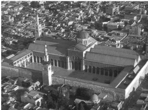
Figure 1. Great Mosque in Damaskus, influenced by the Roman architecture

Islamization of knowledge is a recent term that was developed by contemporary Muslim scholars in order to bridge the gap between Islam and the various fields of modern thought (Figure 1) 1 . Modern disciplines must be critically examined and their philosophical foundations be recast into the Islamic vision, while the Islamic thought should benefit from the recent progress in methodologies, approaches, instrumentations, and progress in new sciences 2 .