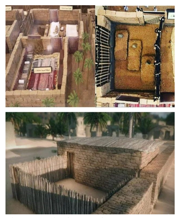
Figure 2. Illustration of the house of the prophet Muhammad (Youtube: Muslim Central: Replica of The Prophet's <sup>@</sup>House | Inside The House of Aishah (ra) - Shaykha Fatima Barkatulla)

Islamic principles that are very compatible with the concept of building a house are Habluminallah , Habluminannas and Habluminal'alam . The application of Islamic principles in the design of residential homes, among others, is the application of the Value of Habluminallah . A comfortable dwelling is a house that can provide peace and security for its inhabitants or a house that meets the criteria of an Islamic house. The following is an illustration of the Prophet Muhammad SAW's house design which can be used as a reference for ideas for building a house. This illustration can be seen in Figure 2.