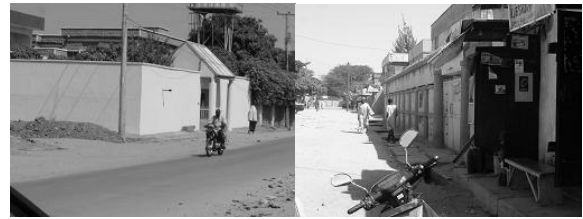
Figure 13. Modern residential structure, a symbol of atomism?

...We have a situation today in which most people have lost the wisdom and experience that generated the traditional fabric. The link was lost between Islamic cultural identity and its manifestations in the built environment as modern concepts and practices have continued to shape urbanization outside of that rich tradition 46 .