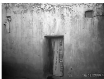
Figure 6. The house master's private area ( turaka )

In the private realm what one sees first is the Turaka or the house master's separate area (in some cases). It contains a large parlour inside which there is a bedroom and at another angle the toilet. In some cases foodstuff are stored there. Except the house master or his wife/wives, nobody goes there. In some houses a separate part for the mother of the house master comes next which also contains a parlour inside which there is a bedroom and a toilet. What comes next is a very wide and spacious open courtyard. Its size depends on the magnitude of the family, the socio-economic or the political status of the owner 38 .