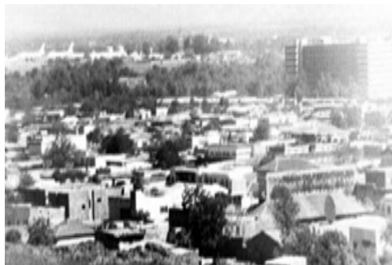
Figure1. The aerial view of Kano city

Sarki Yaji Dan Tsamiya (1349-1385) was the time during which Islam became a state religion in Kano