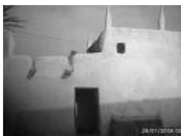
Figure 2. The kofar gida with dakali alongside its wall