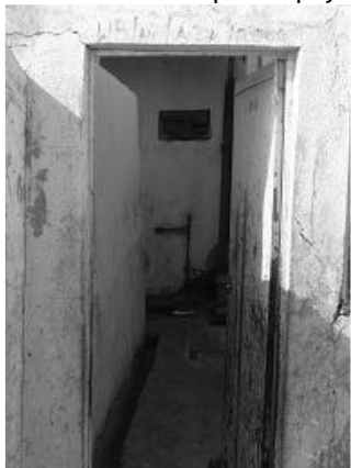
Figure 14. Direct view of the cikin gida from outside. An indication that audio - visual privacy is now a thing of the past

and annoying neighbours with terrible sound. The human scale in these modern houses is forced to give way for the domination of the geometrical one. The brick enclosure isolates one from the people and wanes away from him the spirit of concern for the welfare of others as well as the feeling of social belonging. This symbolizes the replacement of collectivism with individualism or atomism which is repugnant to the Islamic social philosophy.