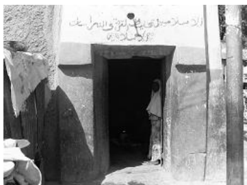
Figure 3. The kofar gida

The house or residence is the building block of cities, hamlets, towns, conurbans, etc. One scholar observes that: