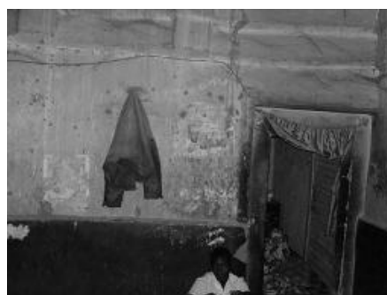
Figure 9. A wife's daki in the rumfa

In the wife's room, on the right, is a short mud barrier called Ingurfuni or Babbaka . It begins some distance by the right from the entrance and stretches to about 2.5 metres, leaving a gap from the other wall. This gap serves as a passage to the inner room. Height of this barrier does not reach up to the room's ceiling 16 . The room is thus partitioned into Farfajiya (outer part serving as a reception area for special female guests) and Kurya (the inner part where the bed, in some cases, made up of mud, is positioned). Lamp hole ( Alkuki ) is carved in the wall and pot for storing cool drinking water ( Randa or Tulu ), with a cover ( Faifai ), rests on the floor against the mud barrier. Suspended from the room's ceiling by a rope is a container pendulum ( Ragaya ) in which very personal and vital items such as money, thread, needles, cotton, etc., are kept.