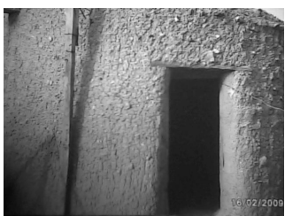
Figure 7. The special reception area ( kudandan )

The open courtyard modifies the climate and allows for outdoor activities with protection from wind and sun in very hot areas like Kano. It also serves as an air well into which the cool, night air can sink 39 . As traditional house in urban Kano is high-walled with few or no windows it withstands severe elements like hot winds and blown sand. Positioned at the far end of this open courtyard is a large parlour ( Rumfa ) that houses the wives' rooms and a female guest room. There is a single entrance to it from Tsakar gida and two coverless windows high on top of it. The roofing is dome-like ( Daurin guga ).