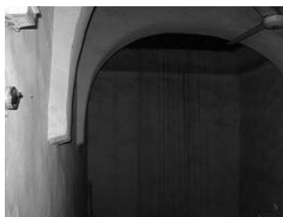
Figure 10. The innermost part of the room ( kurya )