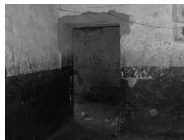
Figure 5. From zaure to soro