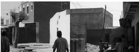
Figure 15. Air pollution, blockage and obstruction of public right of passage

Comparing the traditional Islam-oriented residential structure with the western/modernity-oriented one, it becomes clear that in the former a house is conceived as a safeguard for integrity and privacy, an abode for the inmates, a stop-over for the wayfarer, a helping hand for the needy, an avenue for social cohesion, a venue for celebrities, an office for private discussion, a protection for the neighbour's integrity, a haven for societal morality and chastity, a mosque and a school. In the latter, however, a house will be found to be narrowed down to a solitary, a prison, a symbol of uncontrolled freedom, a disturbance to and infringement upon the neighbour's rights, an ostentation, a despair to the wayfarer and a street.