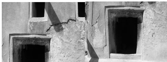
Figure 8. Entrance to the parlour ( rumfa ) and the coverless windows on top of it

There is a reasonable distance between rooms in such a way that no door or window of a room directly faces the opposite room. Similarly, no sound or movement from one room could be heard in another room. This parlour contains the innermost and the most private part of the house. This is the bedroom or Daki . It serves not only as a sleeping place but also as an area that keeps valuable items 38 .