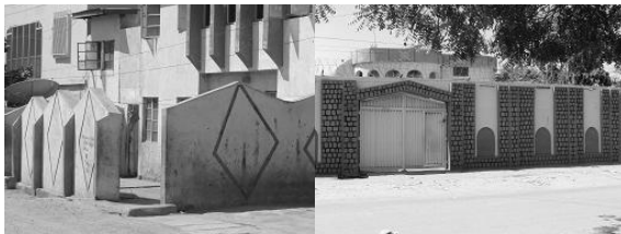
Figure 12. Modern residences that are gradually replacing the traditional islam-oriented ones

This is what used to be a residential structure in urban Kano. It can be referred to as a dual heritage as it combined between the purely traditional and the Islamic. Islamic ethics are successfully integrated in such a way that it led to the eventual creation of a built environment that is human-scaled.