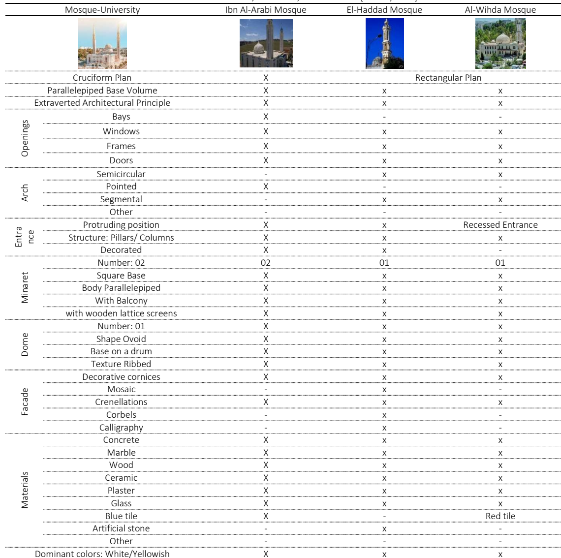
Table 1. Summary table of the study results on the influence of the Emir Abdelkader University Mosque on the recent mosques of Constantine: Ibn Al-Arabi, El-Haddad, and Al-Wihda. [author, 2023]

Construction Materials: Similar to the Emir Abdelkader Mosque-University, concrete was identified as the primary material used in all the structures, later covered with cement and plaster-based wall coatings. We also noticed the use of ceramic and marble cladding, as well as blue tiles inspired by the Mosque-University, which can be found in the Ibn Al-Arabi Mosque. The color palette of the studied mosques predominantly features white and yellow hues, just like the Islamic University Mosque.