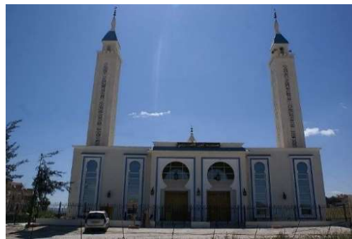
Figure 2. The Ibn Al-Arabi Mosque in Constantine

The Ibn Al-Arabi Mosque (Figure 2) is situated in the highlands of Constantine, Algeria, specifically in the City of Palms, near the national road connecting Mohammed Boudiaf Airport and the city center. It was funded mainly by a local benefactor and was inaugurated on July 31, 2011, by the Minister of Religious Affairs and Wakfs during a visit to Constantine. Covering an area of about 2000 square meters, the mosque's main prayer space is a 30-meter square. Its architecture strongly resembles the Emir Abdelkader Mosque and is heavily influenced by it, earning the nickname "the little Emir" among the locals.