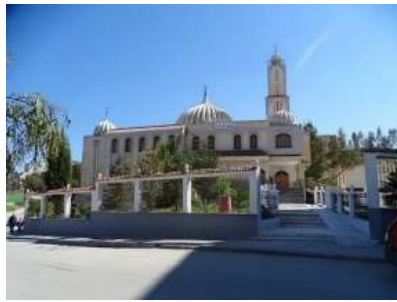
Figure 4. The Al-Wihda Mosque in Constantine