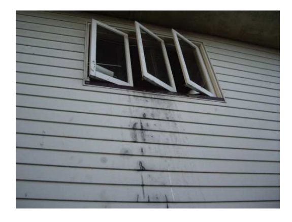
Figure 4. Kitchen windows at Dewi's home

Nonetheless, Dewi is lenient when it comes to gendered space. Although there are separate entrances for each family (front entrance for Andy's family and back entrance for Dewi's family) (Figures 1 and 5), Dewi explains that they share the same living room to watch television or socialize: