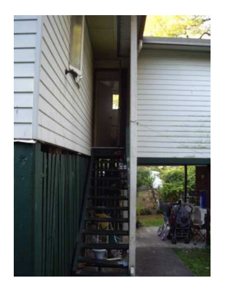
Figure 5. Front entry (Andy's entrance) and back entry (Dewi's entrance)