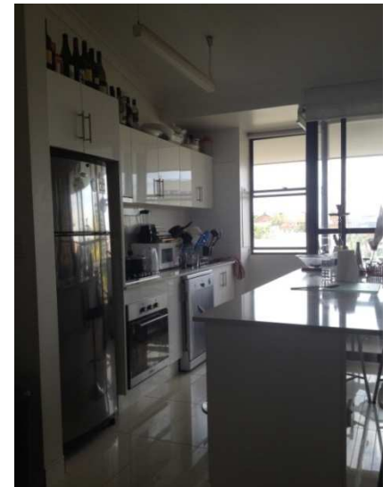
Figure 7. Soraya's kitchen and living area as main hospitality spaces

The cooking load is shared among the three of them. Soraya claims that most of the meals cooked are Western food and not Iranian food. This is because James and Jacob are not used to the smell produced from spicy Iranian ingredients: