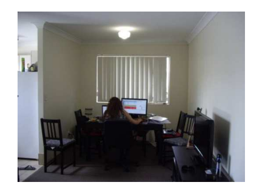
Figure 8. Farid's dining space converted into study area

"It depends on the community of your friends and how big is your gathering. When I was in the previous apartment, the place was twice as bigger than here. I could invite more people to my place but depends on the occasion. Here, sometimes we just get together for a meal for around eight people. This place is big enough to cater for up to twelve people including ourselves".