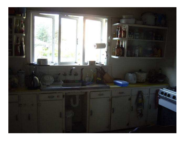
Figure 4. Kitchen windows at Dewi's home

fine because they are frosted glass. The kitchen windows are just clear glass".