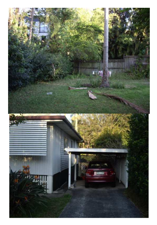
Figure 6. Back yard landscaping and privacy screens