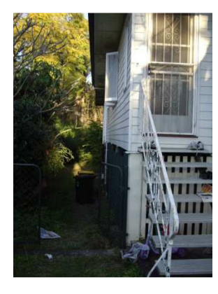
Figure 5. Front entry (Andy's entrance) and back entry (Dewi's entrance)