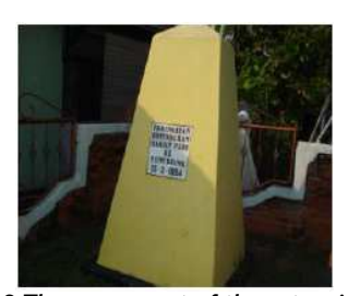
Figure 1.2 The monument of the returning of the Ubi Island's inhabitants to the Untung Jawa Island

The Untung Jawa Island (Kherkhof Amsterdam) has been inhabited since the 1930's when a group of villagers led by Bek Marah, one of the first village chief, migrated from another island that had been hit by a heavy abrasion. However, many years later, these people under the new chief, Bek Saenan, had to migrate to another island, the Ubi Besar Island, around 1940 due to mosquito attack on the island that had created massive suffering to the people of the Untung Jawa Island. Finally, they returned to stay on the Untung Jawa Island in 1954 until now as marked by a monument shown in Figure 1.2.