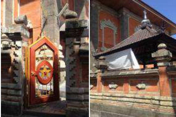
Figure 7. Fence of mosque which applying the element of Balinese style architecture

However, after discussion and persuasive approach the congregation agreed to change the form of al-Qomar Mosque building by applying element of Balinese style architecture. The decision was taken in consideration is more concerned to the existence of al-Qomar Mosque as worship place and gathering for Moslems than feared in the future tangled legal issue as well as issue of horizontal conflict with other believer.