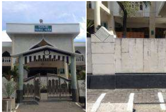
Figure 12. Gate and fence of Nurul Huda Mosque

Nurul Huda Mosque which applying architectural styles of Middle East mosques in the minority neighborhood encourage the ta'mir of mosque and congregation perform adaptation strategy in architectural and non-architectural aspect to prevent horizontal conflict between religious communities. The first strategy is to put an office building that seemed massive form at the left and right of the main mosque building and raising a fence that the Moslems worship does not interfere the absorption of Hindus and Christians worship.