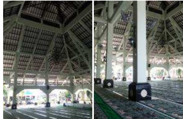
Figure 8. Body part of Sudirman Grand Mosque building

Sudirman Grand Mosque building not have the leg part, and only have a body and head part of the building that make it different from the typical Balinese wantilan form. Body part of building is an open space with no walls and column with canggahwang element to confirm characteristic of wantilan Bali. The building mosque is dominated by white color and without ornament that are meant to show the impression a clean and sacred as a worship place of Moslems as well as to distinguish it from wantilan building owned by Hindus.