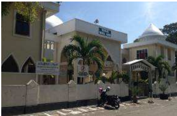
Figure 11. Perspective view of Nurul Huda Mosque

The body part of main building that function as main prayer hall is an open space while building mass on the left and the right side is a massive enclosed space because that function as an office. The curves were used as a structural ornament also function to confirm characteristic of Middle East-style mosque.