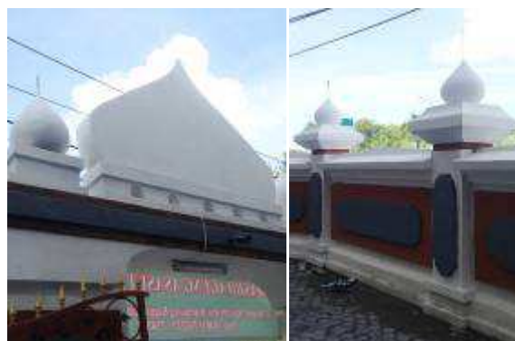
Figure 16. Gate and fence of Asasuttaqwa Mosque

At early 2000, the ta'mir of Asasuttaqwa Mosque encouraged by the local government to applying element of Balinese style architecture to preserving the local architectural tradition. On the one hand, the ta'mir and the congregation of Asasuttaqwa Mosque want to keep the building form is considered ideal mosque to represents a worship place of Moslems, but on the other hand there are demand from the government to applying the element of Balinese architecture.