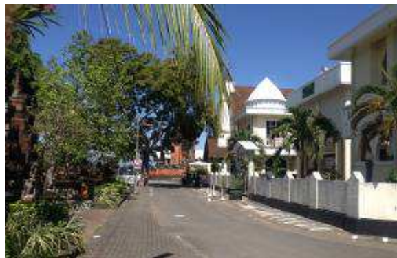
Figure 13. Nurul Huda Mosque located near with temple and church building

Before renovation at 2003, fence of Nurul Huda Mosque resemble with the church fence which open form so that when Moslems worship in a mosque can be seen by Hindus and Christians from the outside of the mosque which cause discomfort for Moslems themselves and for Hindus and Christians who see it. Learning from that experience, then the renovation at 2003 aim to change the fence mosque into massive and high fence.