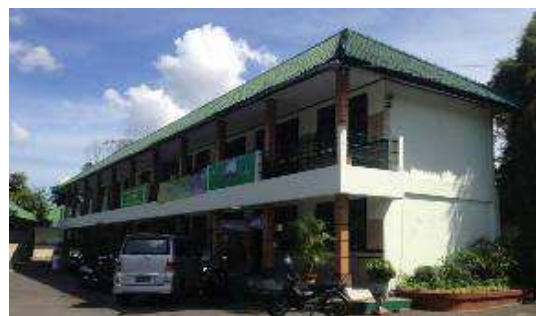
Figure 10. Supporting building of mosque