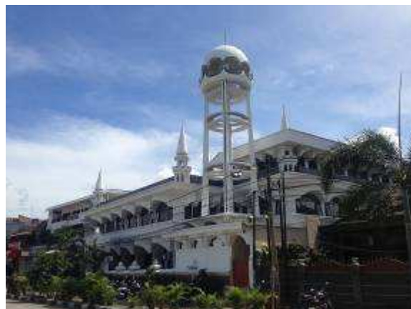
Figure 15. Minaret in one side of Asasuttaqwa Mosque

On one side of mosque building there is a minaret , as well as two smaller minaret on the roof which is intended to give monumental impression that can be recognized the building function as a mosque from the distance. Especially in the minority neighborhood where very limited number of mosques, minaret can be viewed by the people from distance considered necessary to facilitate Moslems to find Asasuttaqwa Mosque.