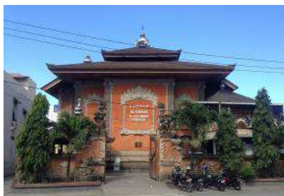
Figure 2. Front elevation of al-Qomar Mosque

The object of study is located in Pura Demak Street, subdistrict of West Teuku Umar, district of West Denpasar. Al-Qomar Mosque built in 1980s was initiated by the elders of the local figure. The beginning of al-Qomar Mosque only a very simple building. Over time, al-Qomar Mosque has been renovated twice in 1995 and 2001, so making the current form of mosque building until present with an area 400 m 2 .