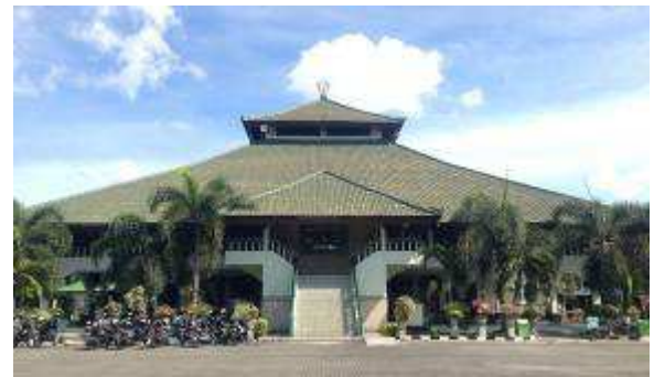
Figure 3. Front elevation of Sudirman Grand Mosque

The object of study is located in Slamet Riyadi Street, District of East Denpasar, in the area of Udayana Military Command. The construction caused of Sudirman Grand Mosque because necessary a worship space for Moslems in the area of Udayana Military Command that are increasingly from year to year.