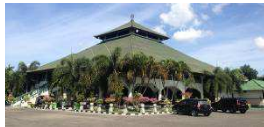
Figure 9. Perspective view of Sudirman Grand Mosque

The head part of mosque building applying a two level storey pyramid roof to confirm characteristic Balinese wantilan building. Roof covered by roof tile with ikut celedu ornament in each edge of the ridge which is a typical ornament of Balinese style architecture. To show identity as a mosque to be easily recognized by Moslems, especially for Moslem traveler, on the top of the roof using ornament of lafadz Allah.