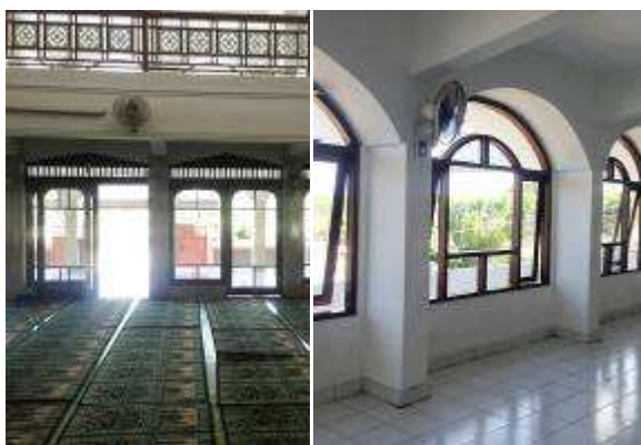
Figure 14. Body part of Asasuttaqwa Mosque

The body part of mosque building consists of two storey building which is dominated white color for show purity and cleanliness value as a worship place of Moslems. The body of mosque building is covered by a door and a window with a widely transparent glass because mosque located in side of main road which congested by vehicles to keep dust and dirt from the street does not enter into the prayer room and can give the impression of openness of space through the transparent glass are used. And used of arch element are intended to confirm the architectural styles of Middle East mosques that applied.