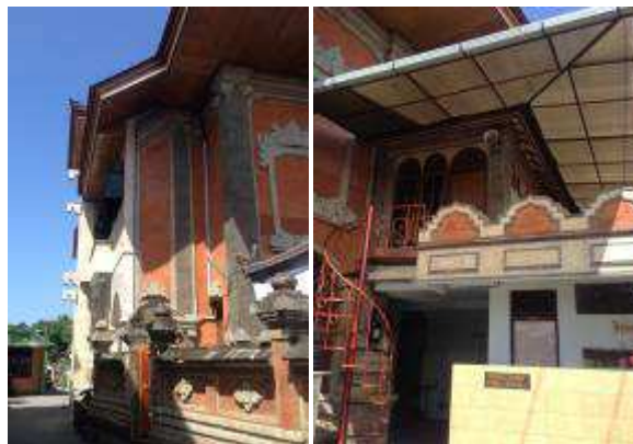
Figure 6. Material and ornament in al-Qomar Mosque

The last renovation at 2001 changed the overall form of al-Qomar Mosque by applying the typical element of Balinese style architecture. From the aspect of building form, the mosque building have leg-body-head part is identical to the concept of tri angga from Balinese style architecture. The leg part of building is identical with bebaturan element from Balinese style architecture, which sustain massive body part because material characteristic that used.