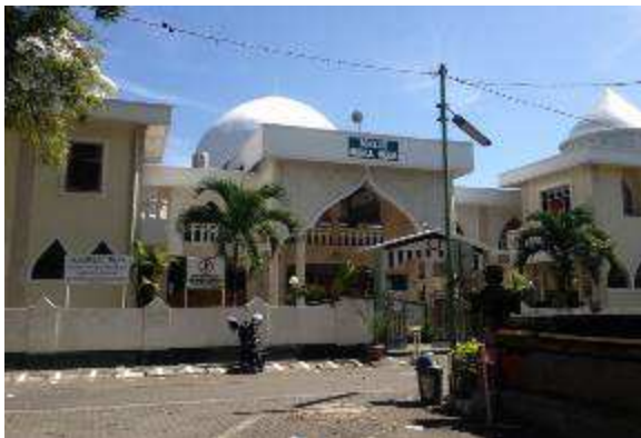
Figure 4. Front elevation of Nurul Huda Mosque

Nurul Huda Mosque was built at 1970 by the idea of Ir. Hertoto and built by PT. Angkasa Pura 1. At the beginning of construction, the mosque have very simple form with a building area 100m 2 . At 2003, Nurul Huda Mosque undergoing renovation and making the current form of the mosque building until present with an area 484m 2 .