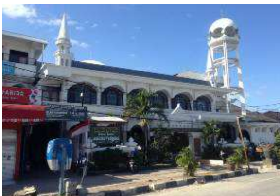
Figure 5. Front elevation of Asasuttaqwa Mosque

Since its constructing, Asasuttaqwa mosque have been renovated four times. Last renovation was conducted at early 1990 to become the present form of the mosque building with an area 529m 2 . Renovation can be completed within a year and running smoothly due to the strength of the material and non-material support from Moslems as a congregation around the mosque and Moslems as government official.