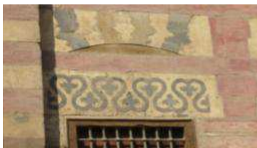
Figure 5: Lintel with trefoil flowers with heart-shaped frames- Facade window of al-Ashraf Barsbay madrasa

Another development occurred when craftsmen added more than one tier of leaves to the trefoil motif to become a complex motif rather than a simple one. This pattern was made of white marble on a black background of marble too. The void created between each two patterns of the same colour was at the same time another pattern in reverse and of the opposite colour. This style of joggled voussoirs was used in the lintels of entrances such as that of Ahmad al-Mihmandar mosque (725 A.H./ 1324-25 A.D.), Farag Ibn Barquq zawia and Taghri Bardi madrasa. It was also used in lintels of façade windows of Barquq madrasa, al-Mu'ayyad mosque, Jani Bek mosque, Taghri Bardi madrasa, al-Ghawri sabil and Khusraw sabil (Figure 4).