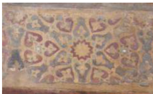
Figure 11: Detail of the star pattern filled with trefoils- Lintel of sabil window of Farag ibn Barquq zawia

Several phases of development reshaped the trefoil and resulted in sophisticated designs. At first, the silhouette of the trefoil stem and base was an ogee, with the upper curve representing the stem and the lower the base. That created the template and its inverse in two steps. Later, the void created by one leaf was at the same time the leaf in reverse, thus reversing the pattern in one step rather than two. The craftsman was skillful enough to treat the trefoil motif differently to create more sophisticated designs. The design on the lintel of the sabil window of Qijmas al-Ishaqi madrasa is a good example of this new treatment. The trefoil was no longer in an upright repetitive position but in clusters. The trefoils appeared to diverge from the center of each cluster, which was semi-octagonal in structure. The final composition was articulated by using a series of black-and-white clusters alternating with one another[21],[22]. The trefoil was also used as filling of a geometric design such as in the lintel of the sabil window of Farag ibn Barquq zawia (Figure 11) and the lintel of the sabil door of Qijmas al-Ishaqi mosque (Figure 12).