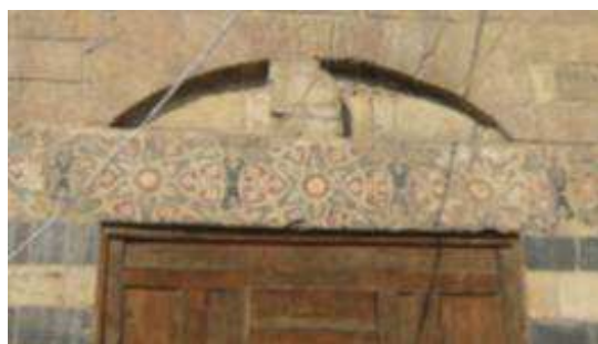
Figure 7: Lintel with geometric decorations of coloured marble- Sabil window of Farag ibn Barquq zawia.

Like the arabesque, geometric designs were also used to decorate joggled voussoirs as a thin layer of coloured marble. The star pattern, which parts were filled with trefoil flowers in colored marble, was used in the lintel of the sabil window of Farag Ibn Barquq zawia (Figure 7). Another example is seen in the lintel of the sabil window of Qijmas al-Ishaqi mosque (885-86 A.H./ 1480-81 A.D.). The design takes the shape of a semi-octagonal structure filled with clusters of trefoils and repeated in a rhythmical way with contrasting colours for the trefoils and background.