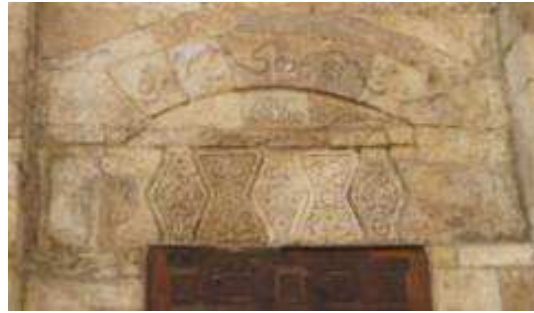
Figure 9: Lintel, nafis and relieving arch with various floral decoration carved on stone- Façade window of al-Salih Najm al-Din Mausoleum.