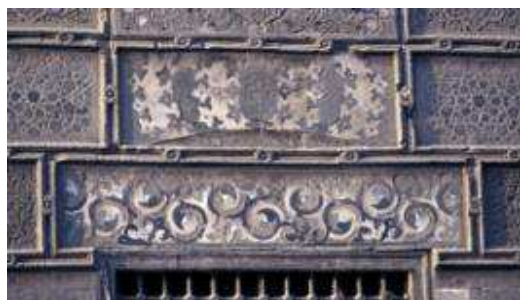
Figure 6: Lintel with arabesque decorations on marble- Facade window of Qaytbay sabil

The arabesque is another elaborate design that was rarely used for joggled voussoirs due to its complex form. The arabesque is a special ornament that included curved scrolls together with leaves, palmettes and rosettes which are varying in size and degree of stylization. The elements of the design are intimately connected with each others with rhythmical alternation of movement always rendered with harmonious effect[14],[15],[16],[17]. The use of arabesque was witnessed in the lintels of windows of Qaytbay sabil which were made of coloured marble.