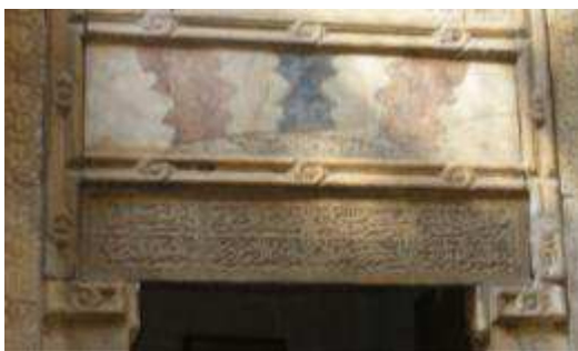
Figure 15: Lintel with carved inscriptions-Entrance of Abd al-Rahman Katkhuda sabil

Inscriptions were the least used decorative element on lintels and relieving arches. Only four of the studied monuments revealed using inscriptions on lintels and none on relieving arches. A band of inscription in naskh script was carved on the lintels of the façade windows of Qalawun complex, al-Nasir Muhammad madrasa and Qatlubugha al-Dhahabi madrasa (748 A.H./ 1347 A.D.). The foundation inscription was also carved on the marble lintel of the entrance of Qalawun complex in addition to Abd al-Rahman Katkhuda sabil (Figure 15). The inscription on the latter is a poem written in naskh script in two lines, arranged in six cartouche-like compartments and the marble slab is framed with a frame of floral decorations.