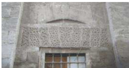
Figure 2: Stepped voussoirs of lintel and sloping voussoirs of relieving arch- Sulaymania takiyya side facade

The sloping voussoirs were more suitable for relieving arches as seen in the relieving arch of the façade windows of al-Nasir Muhammad madrasa (695-703 A.H./ 1295-1304 A.D), Sangar al-Gawli madrasa (703 A.H./1303-4 A.D.), Sarghatmish madrasa, Inal al-Yusufi madrasa, Qanibay mosque, Sulaymania takiyya (Figure 2) and Abd Allah Katkhuda Azaban sabil ( 1132 A.H./ 1719 A.D.) (Figure 3).