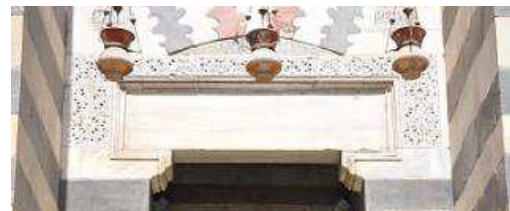
Figure 1: Lintel of marble- Entrance of al-Ashraf Barsbay madrasa

In many cases the architect preferred to use one slab of stone for the lintel, which rested on the two side shoulders of the door opening and provided a considerable strength to that opening. The slab was made of white marble such as in the entrances of al-Ashraf Barsbay madrasa (829 A.H./ 1425 A.D.) (Figure 1), Abd al-Rahman Katkhuda zawia (1142 A.H./ 1729A.D.) (Figure 8) and his sabil in al-Mufiz Street (1157 A.H./ 1744 A.D.) and the entrance of Ali al-Mutahhar mosque (1157 A.H./ 1744 A.D.). In other cases the lintel was made of a slab of granite such as in the entrances of Shaykhu khanqah and madrasa (750-756 A.H./ 1349-1355 AD.), Ulgay al-Yusufi madrasa (774 A.H./ 1373 A.D.) and al-Ghawri madrasa (909-10 A.H./ 1504-5 A.D.) Neither marble nor granite was used for lintels of windows.