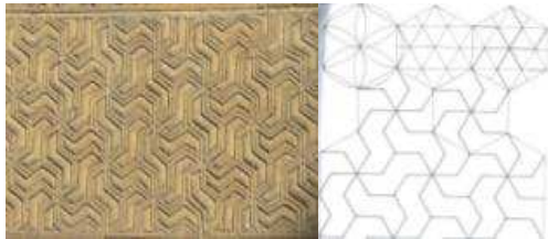
Figure 14: Geometric design of lintel and way it was drawn based on the hexagonal shape- Lintel of one of the facade window of Baybars madrasa

Inscriptions were the least used decorative element on lintels and relieving arches. Only four of the studied monuments revealed using inscriptions on lintels and none on relieving arches. A band of inscription in naskh script was carved on the lintels of the façade windows of Qalawun complex, al-Nasir Muhammad madrasa and Qatlubugha al-Dhahabi madrasa (748 A.H./ 1347 A.D.). The foundation inscription was also carved on the marble lintel of the entrance of Qalawun complex in addition to Abd al-Rahman Katkhuda sabil (Figure 15). The inscription on the latter is a poem written in naskh script in two lines, arranged in six cartouche-like compartments and the marble slab is framed with a frame of floral decorations.