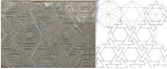
Figure 13: Geometric design of lintel and the way it was drawn based on hexagonal shape- Lintel of one of the the facade windows of Baybars madrasa