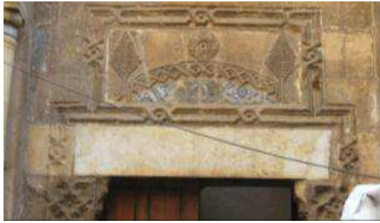
Figure 8: Nafis with coloured tiles- Entrance of Abd al-Rahman Katkhuda zawia