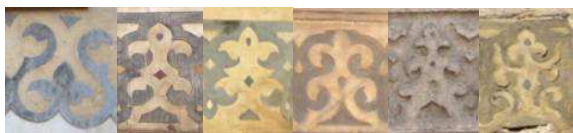
Figure 10: Various types of simple and complex trefoil motif.

The study of the decorations executed on lintels, nafis and relieving arches reflects a high ability and major skill of craftsmen to use attractive motifs on facades. Generally, floral motifs were the prevailing motifs of lintels, nafis and relieving arches. The trefoil was the dominant motif that was used in diversified forms; alone in a simple form, framed with scrolls in heart shape, unframed with two tires of leaves and complex with stylized leaves (Figure 10).