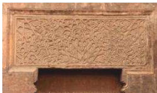
Figure 12: Geometric design filled with trefoil and leaves- Lintel of sabil door of Qijmas al-Ishaqi madrasa

The arabesque was also preferred by craftsmen, especially for the carved decorations on stone. It represents another sophisticated form of floral decoration. Its limitless, rhythmical alternation of movement, conveyed by the reciprocal repetition of curved lines, produced a design that is balanced and free of tension[23]. The arabesque was intended to reflect the richness of the design and the skill of the craftsman rather than the richness of the material used. This fact is confirmed as the artist chose only the arabesque for the decoration of such a limited area as the nafis (figures 1, 6, 9, 15).