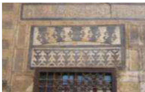
Figure 4: Lintel with trefoil complex flower and relieving arch with trefoil flower- Khusraw sabil

The complex joggled voussoirs could be divided into two main groups of designs; the floral designs and the geometric designs. The trefoil flower was the main motif of floral designs that was widely used for voussoirs with a variety of shapes and degrees of complication. The first type of voussoirs presented the trefoil flower cut on the sides of the voussoirs in a horizontal position. It seems that this type of voussoirs was generally used for relieving arches. In some cases only one trefoil flower flanked with two leaves were cut on voussoirs such as in the relieving arch of the entrances of al-Maridani mosque, Ulgay al-Yusufi madrasa, Barquq madrasa, al-Mu'ayyad mosque, Jani Bek mosque (830 A.H./ 1426-27 A.D.), Taghri Bardi madrasa, , and al-Ghawri khanqah (909-10 A.H./ 1504-5 A.D.). They are also seen in the relieving arches of the façade windows of al-Ghawri sabil and Khusraw sabil (942 A.H./ 1535 A.D.) (Figure 4). In other cases, three trefoil flowers were cut on the sides of the voussoirs such as in the relieving arch of a window of Qaytbay sabil (884 A.H./ 1479 A.D) (Figure 6) and the lintel of a window of Yusuf Bek sabil (1044 A.H./ 1634 A.D.).