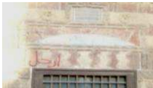
Figure 3: Wavy voussoirs of lintel and sloping voussoirs of relieving arch - Abd Allah Katkhuda Azaban sabil

It is worth mentioning that the above mentioned types of voussoirs were usually cut of limestone only, either of one colour or two colours used alternately. Only the wavy type of voussoirs (with concave and convex sides) was executed on both coloured stone and coloured marble.