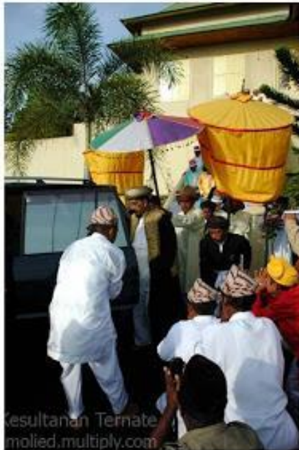
Figure 5. Cultural shift In Mosque Ternate Traditional