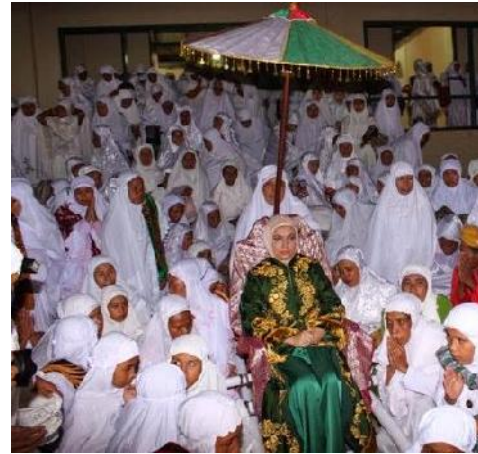
Figure 6. procession Of Kolano Uci Sibe