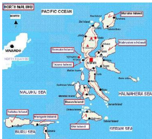
Figure 1. North Maluku Map

Ternate city is located under the foot of Mount Gamalama in North Maluku Province.