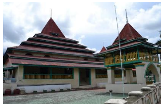
Figure 3. Empire Mosque Of Ternate Source: roeslyblog and researchers , 2014