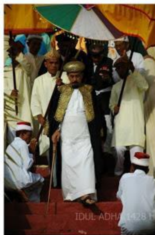
Figure 4. Kolano Uci Sabea

In one year, the ritual Kolano Uci Sabea executed four times, including at night Qunut, Lailatul Qadr Night (both in the month of Ramadan), and the Eid al-Fitr and Eid al-Adha. Implementation Kolano Uci Sabea done by any hereditary Sultan of Ternate until now. According to the trust, under any circumstances Kolano (Sultan) must do Sabea (salat) at Sigi Lamo (Sultan Mosque).