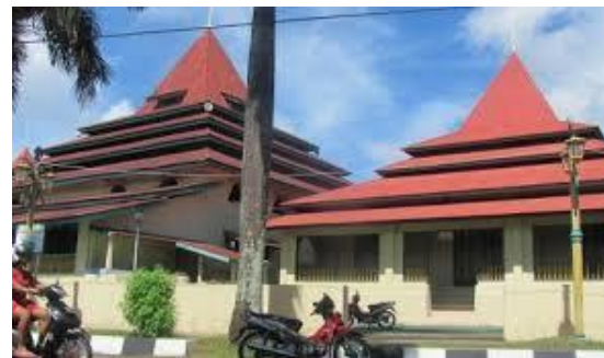
Figure 7. Mosque for women who are on the right side of the Sultanate of Ternate Mosque