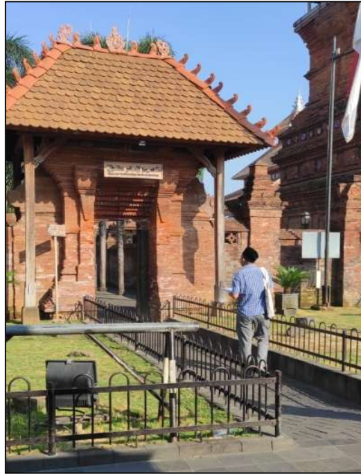
Figure 1. The Sunan Kudus Tomb Religious Tourism Site

The problem of accessibility barriers for people with disabilities in several facilities at the Sunan Kudus tomb religious tourism site can be overcome through a universal design approach. Universal design is a human-centered approach to product and environmental design that can be used by all groups, regardless of age, gender, and diversity, as much as possible, without the need for adaptation or special design [18]. In general, universal design provides benefits for all groups, including both able-bodied individuals and those with special needs. The Universal Design approach seeks to minimize the challenges individuals face over their lifetimes due to life changes or unexpected disabilities. It aims to develop environments and products that ensure equal accessibility for all people, regardless of their diverse characteristics. Universal Design views the entire population inclusively, acknowledging the spectrum of human abilities and bodies [19].