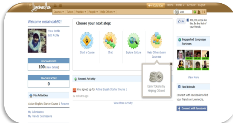
Figure 2. Profile in Livemocha.com

Next step is editing the profile and start to make friends. Livemocha will suggest new friends from all countries. the learner may directly join in chat room or start the course.