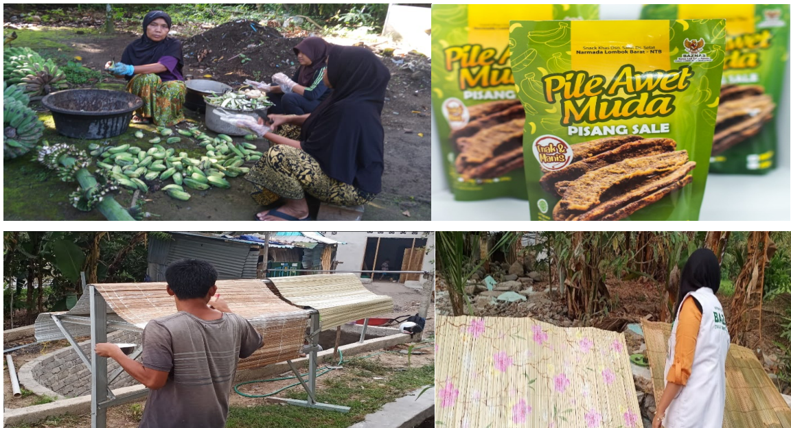
Picture 3. Youth Creative Products

Second; Zakat Community Development program institution does not only empower the community and youth but also has an important role in increasing the value of the products produced by the community and youth . Products that previously could be said to be mediocre, then with the existence of this community development zakat program , the community and youth are encouraged to produce creative products so that they can increase the value of the products produced.