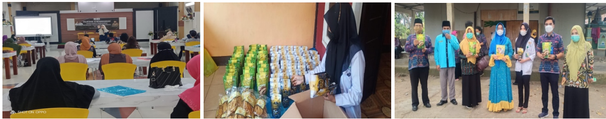
Picture 3. Training, Coaching and Product Exhibition

Fourth; The business or strategy of the Zakat Community Development Program Institute often carries out coaching, training and exhibitions for the products it produces. Guidance and training are carried out to increase public and youth understanding to produce various creative innovations to increase the value of the products produced. The product exhibition was held to increase community and youth references regarding innovative creative products with the hope that they can be implemented in Selat Village, West Lombok Regency. During the implementation of training, coaching and exhibition activities based on interview data it can be seen that youth have a high level of participation and enthusiasm .