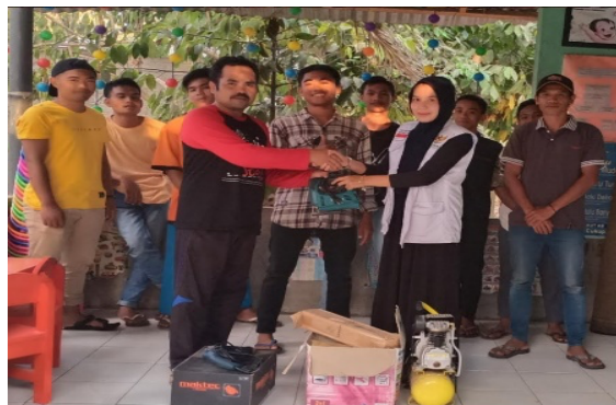
Picture 2. Assistance Zakat Community Development

Third; The Zakat Community Development program institute provided assistance with tools and materials to support community activities and manufacture MSME products by utilizing existing natural resources and then packaging them in creative forms to increase the value of the products produced.