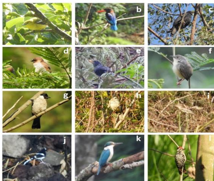
Figure 3. Some of the best observed species in Coban Tarzan; a. Cipoh kacat ( Aegithina tiphia ), b. Cekakak jawa ( Halcyon cyanoventris ), c. Elang hitam ( Ictinaetus malaiensis ), d. Bondol peking ( Lonchura punctulata ), e. Ciung batu siul ( Myophonus caeruleus ), f. Prenjak ( Prinia inornata ), g. Cucak kutilang ( Pycnonotus aurigaster ), h. Merbah cerukcuk ( Pycnonotus goaivier ), i. Kapasan kemiri ( Lalage nigra ), j. Meninting besar ( Enicurus leschenaulti ), k. Cekakak sungai ( Todiramphus chloris ), dan l. Caladi ulam ( Dendrocopos macei ).

Field observations showed that the birds found consisted of several orders, including Galliformes, Accipitriformes, Apodiformes, Piciformes, Coraciiformes and Passeriformes. Several sightings documentation results can be seen in the picture are as follow.