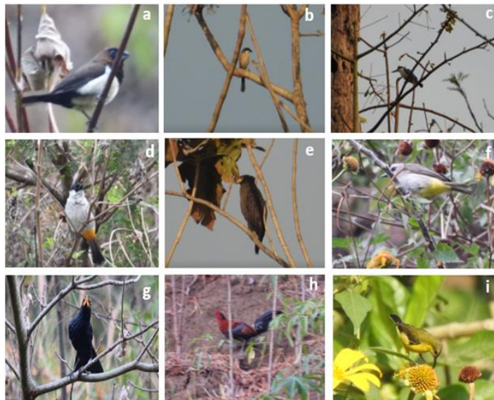
Figure 2 . Some of the observed species in coban tarzan, from left to right, top to bottom: a. Bondol jawa ( Lonchura leucogastroides ), b. Bentet Kelabu ( Lanius schach ), c. Cekakak Sungai ( Todiramphus chloris ), d. Cucak kutilang ( Pycnonotus aurigaster ), e. Elang ular bido ( Spilornis cheela ), f. Merbah cerukcuk ( Pycnonotus goavivier ), g. Ciung batu siul ( Myophonus caeruleus ), h. Ayam hutan merah ( Gallus gallus ), dan i. Burung madu sriganti ( Nectarinia jugularis ).