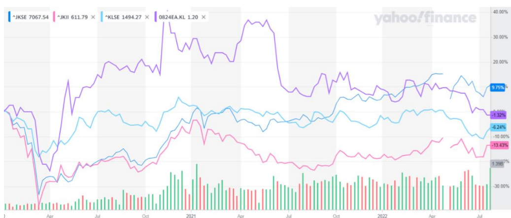
Figure 1. The movement of the JCI, JII, KLSE, and DJICHK stock price indices for the period January 2020-July 2022

This condition results in economic turmoil in a country, affecting other countries with relations with that country. It is in line with the theory that suggests the causes of index movements in the capital market: 1) From the supply side, the number of shares is too much compared to the demand; 2) Tight money policy, accompanied by high-interest rates on the money market, played a significant role in sucking up stock exchange activity and transferring excess liquidity to the money market; 3) External and foreign factors, such as the shadow of a world recession due to the Gulf crisis. The soaring oil prices and the hit to the western domestic economy, especially the United States, have caused fluctuations decline in stock price indexes, such as Wall Street in New York, and Tokyo (Nikkei) to Hong Kong (Hang Seng) in Singapore and Kuala Lumpur (Supranto, 2004).