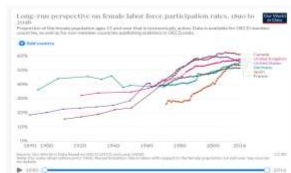
Figure 1. Long-Term Perspective of Female Labor Force Participation Rate from 1890 to 2016. ( https://ourworldindata.org/female-labor-supply )

The increase in the number of female workers is one of the important markers of economic growth. Note that a sharp increase in the number of female workers occurred in the 20th century, where the number of women participating in the labor market in early industrialized countries is shown in graph 1.0. This graph illustrates the level of participation of economically active women by combining data from OECD (Organization for Economic Cooperation and Development) members. The graph shows a positive trend in all countries, although starting at different points in time and continuing at different levels; yet the substantial and sustained increase in female labor force participation in rich countries remains a striking feature of economic and social change in the twentieth century.