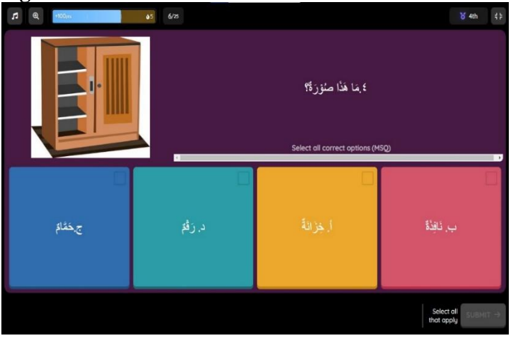
Figure 3. Creating Questions on the Quizizz Platform