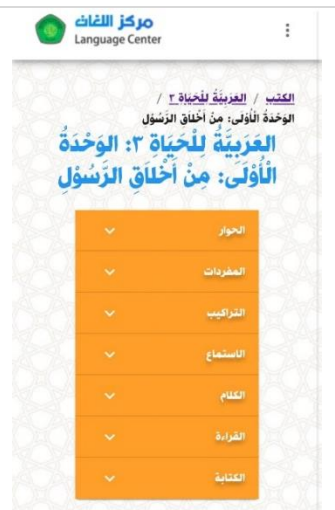
Figure 1. Dictionary