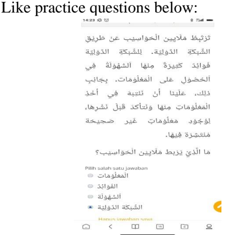
Figure 7. Qiroaah practice questions 1

This method is an Arabic language learning method that emphasizes reading a text or sentence so that it can read and pronounce Arabic properly and correctly. Practicing giraah skills can be done by getting used to reading the text of the story which is then retold and being able to also answer questions from the story which of course uses Arabic.