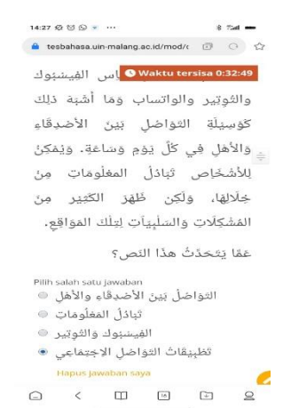
Figure 8. Qiroaah practice questions 2