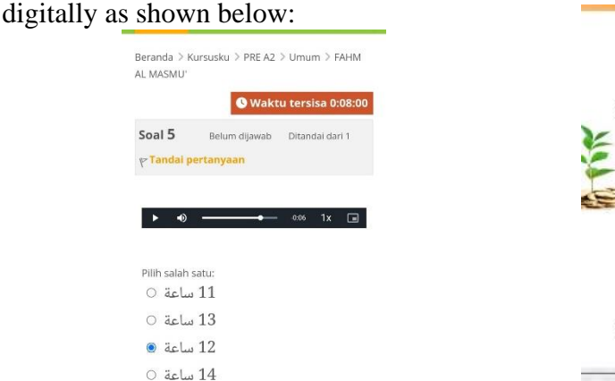
Figure 5. Practice Isma'

usually a teacher gives material and reads it to students after which the students imitate it. This is very necessary in supporting the learning of Arabic which we usually refer to as the word istima' but because digital development is very advanced, it can also be done