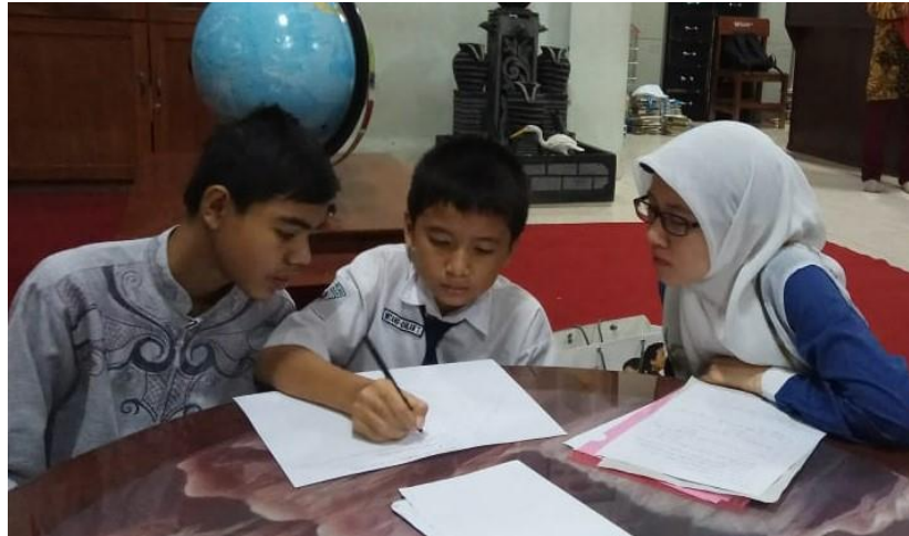
Figure 1. the process of collecting data 1

intersect the sides of a triangle. (5) The student draws a line, which is the intersection of two circles vertices of the triangle with the run. The lines formed derived from the vertex intersection of the circular arc side wedge and in front of the triangle. (6) students can explain the characteristics of the lines that lie in the triangle from start to finish drawing.