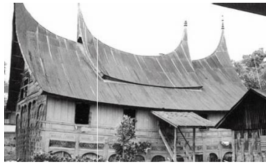
Figure 2. Rumah Gadang Gonjong Ampek Sibak Baju