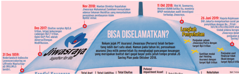
Figure 1 Travel Map of Jiwasraya Insurance