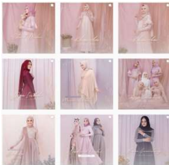
Figure 3. Gold shade theme on @puthic.id