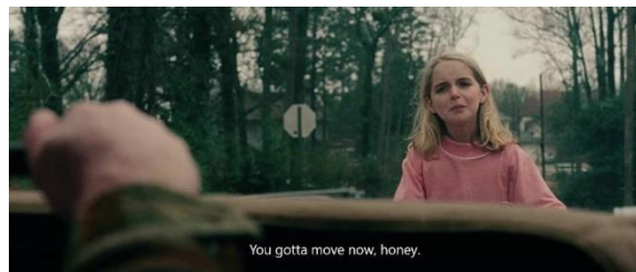
Figure 1. Tonya (in pink) is trying to prevent her dad from leaving (From I, Tonya [00:10:47], by Craig Gillespie (director), 2017)

Throughout the early part of the film, various scenes and dialogue reflect Tonya's unpleasant childhood experience. Horney underlined the role of childhood events in the development of neurotic personalities. Horney stated that one of the significant impacts that shape a child's personality is traumatic events such as neglect, physical abuse, sexual abuse, verbal abuse, and rejection (Schultz & Schultz, 2017, p. 139).