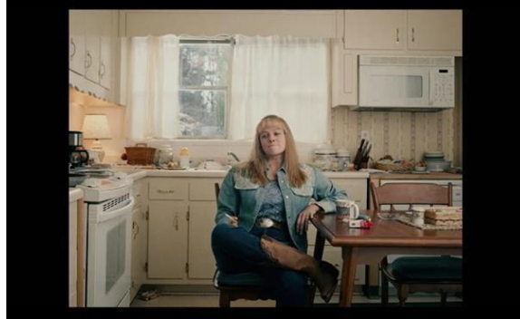
Figure 6. Tonya, in modern day, is talking about herself.

According to Horney, neurotic people need social recognition and unassailability. People with this kind of neurotic need always try to be the most important, to be first, or to attract attention to themselves (Feist et al., 2018, p. 178). Tonya's need for social recognition and unassailability can be seen through the excerpts below: