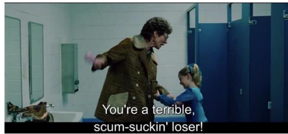
Figure 2. Lavona abused Tonya since she was a child (From I, Tonya [00:07:23], by Craig Gillespie (director), 2017)

The second piece of data, which reflects Tonya's difficult childhood, is shown below.