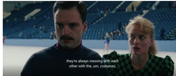
Figure 3. Jeff (left) is emphasizing the fact on the threat against Tonya (right). (From I, Tonya [00:59:18], by Craig Gillespie (director), 2017)

The aggressiveness and the drive to be superior over others are illustrated through the findings below.