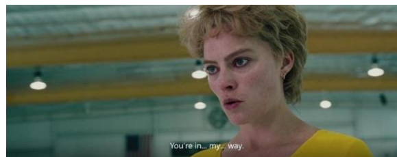
Figure 5. Tonya is threatening other skaters in the skating rink. (From I, Tonya [00:01:18], by Craig Gillespie (director), 2017)

According to Horney, neurotic people whose response toward hostility is moving against people, tend to need power. Neurotic people with this need tend to control other people and avoid feeling weak and stupid (Feist et al., 2018, p. 178). This kind of need is usually combined with the need for prestige and possession. Tonya's need for power can be seen through the excerpts below: