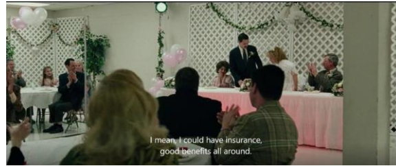
Figure 7. Tonya is having a wedding party by being married to Jeff Gilooly. (From I, Tonya [00: 30:34], by Craig Gillespie (director), 2017)