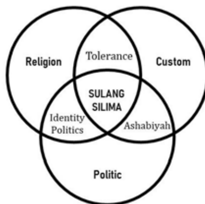
Figure 2 Social Intersection Pattern of Pakpak Society

Figure 2 illustrates the intersection of interests between Islam and Adat in Pakpak politics, directed at the Sulang Silima customary institution. By using the diagram, we can see how the integration between